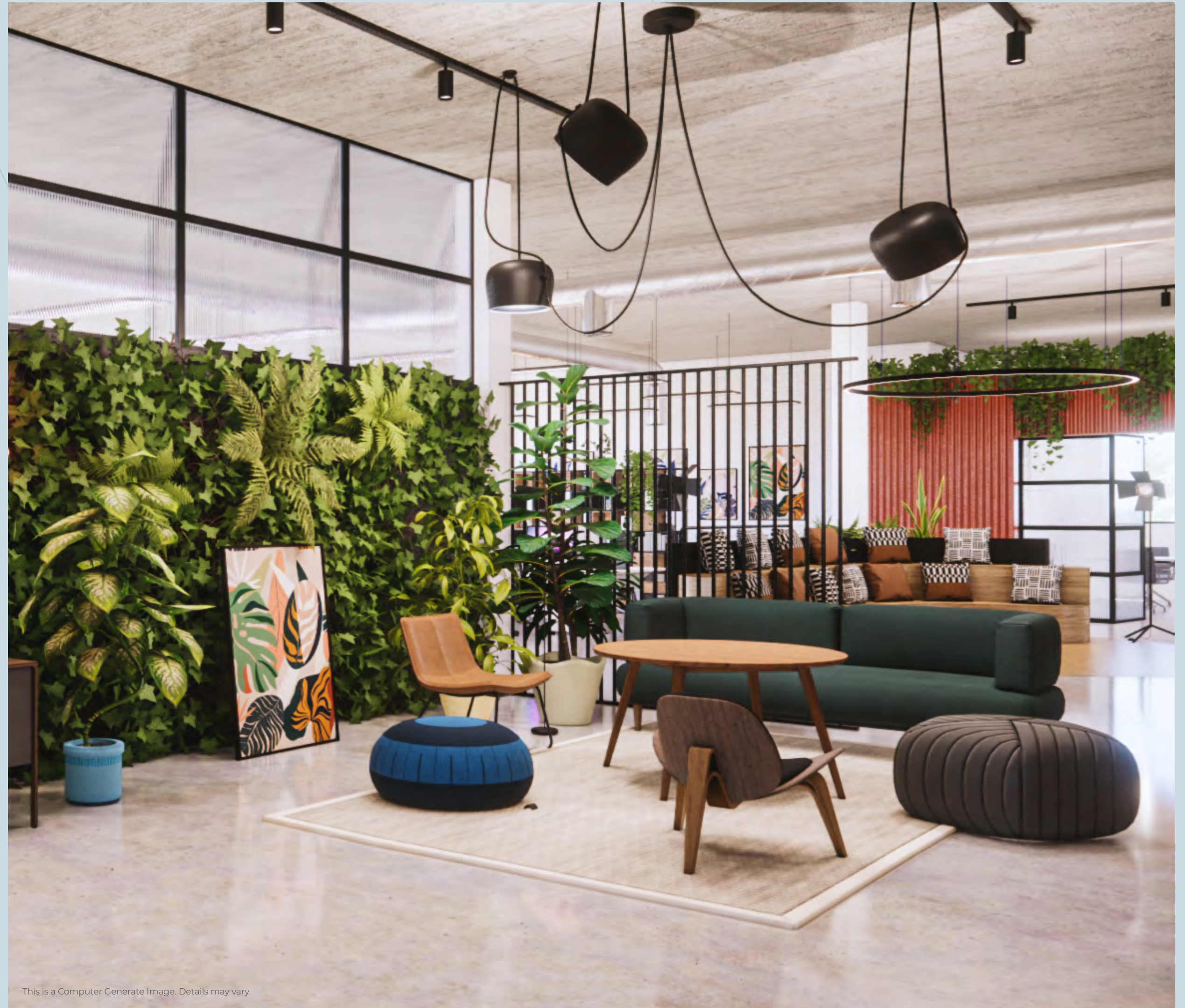
This is a Computer Generate Image. Details may vary.